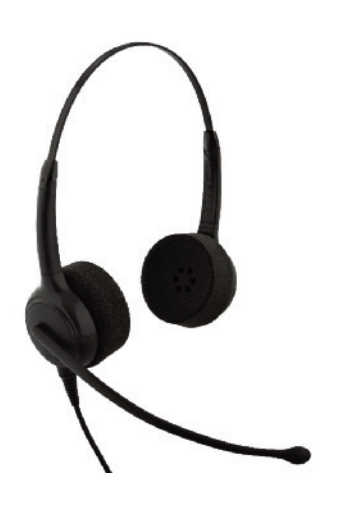
CC Pro gives you the best of everything—including value.