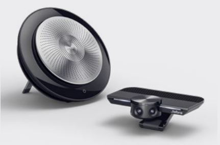
JABRA SPEAK + PANACAST

An unbeatable collaborative meeting experience