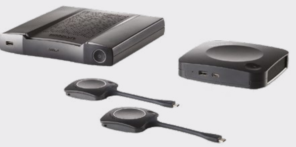
BARCO CLICKSHARE CONFERENCE

ClickShare Conference connects instantly to the Jabra Panacast, Jabra Speak and display screen. Our proven and validated integration allows you to Bring Your Own Meeting and link up with remote colleagues in a matter of seconds.